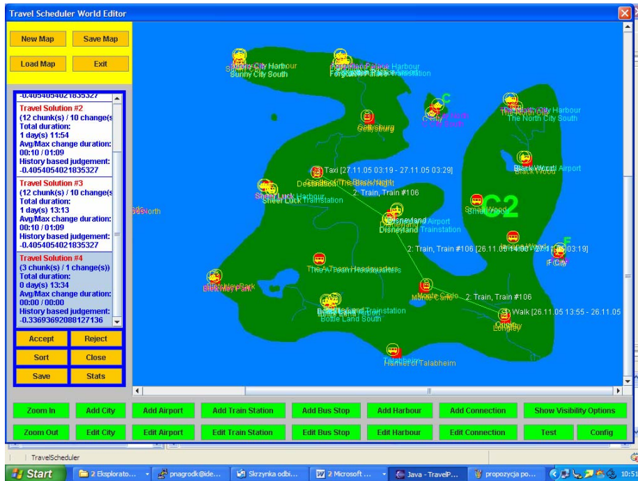
Fig. 2. Screen-shot of the system as it is currently implemented

Planning with date of departure and date of arrival. As every trip planning system, algorithm presented here allows user to issue travel queries that may be either given date of departure or date on which he or she has to reach the destination location. From the technical point of view, there are only small differences in the algorithm in both cases – only time definitions of ‘next’ and ‘previous’ stations are being swapped. In the case of planning to arrive at the given date, the planning takes place from the end toward the beginning – stages of travel divisions are being implemented from the last to the first.